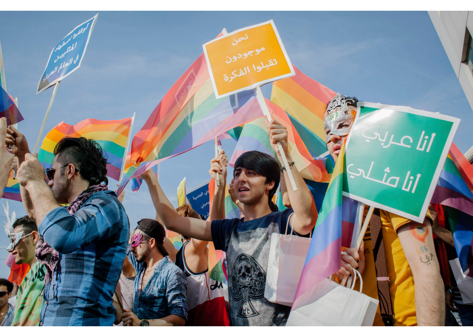
LGBTQ+ Syrians carry placards in Istanbul during the banned Pride events in 2015. The signs in Arabic read "I'm Arab, I'm gay" and "We're here, get used to it."