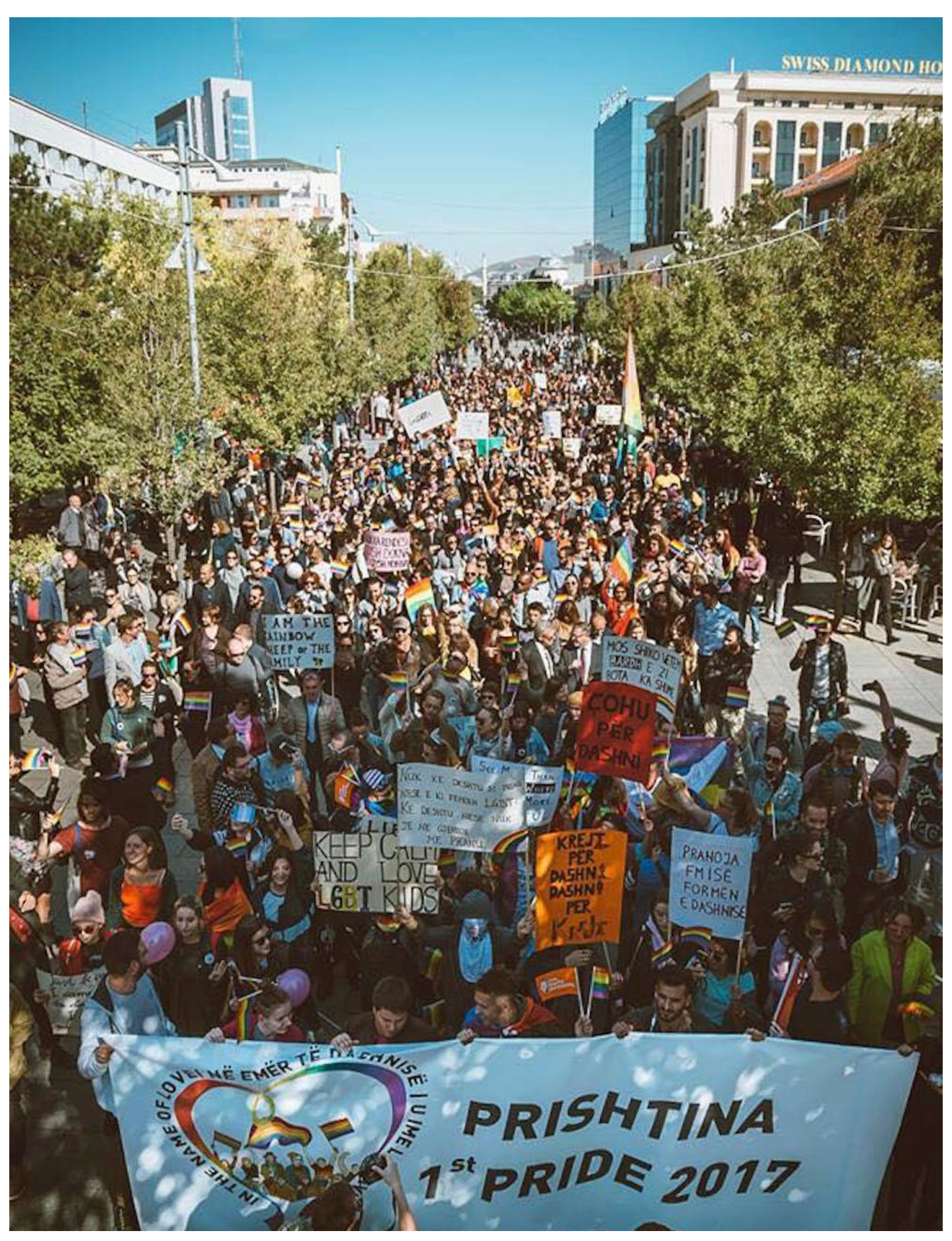
Prishtina Pride Parade 2017.