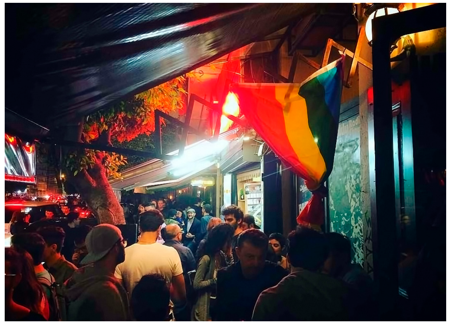
A rainbow flag flying in Mar Mkhayel in east Beirut.