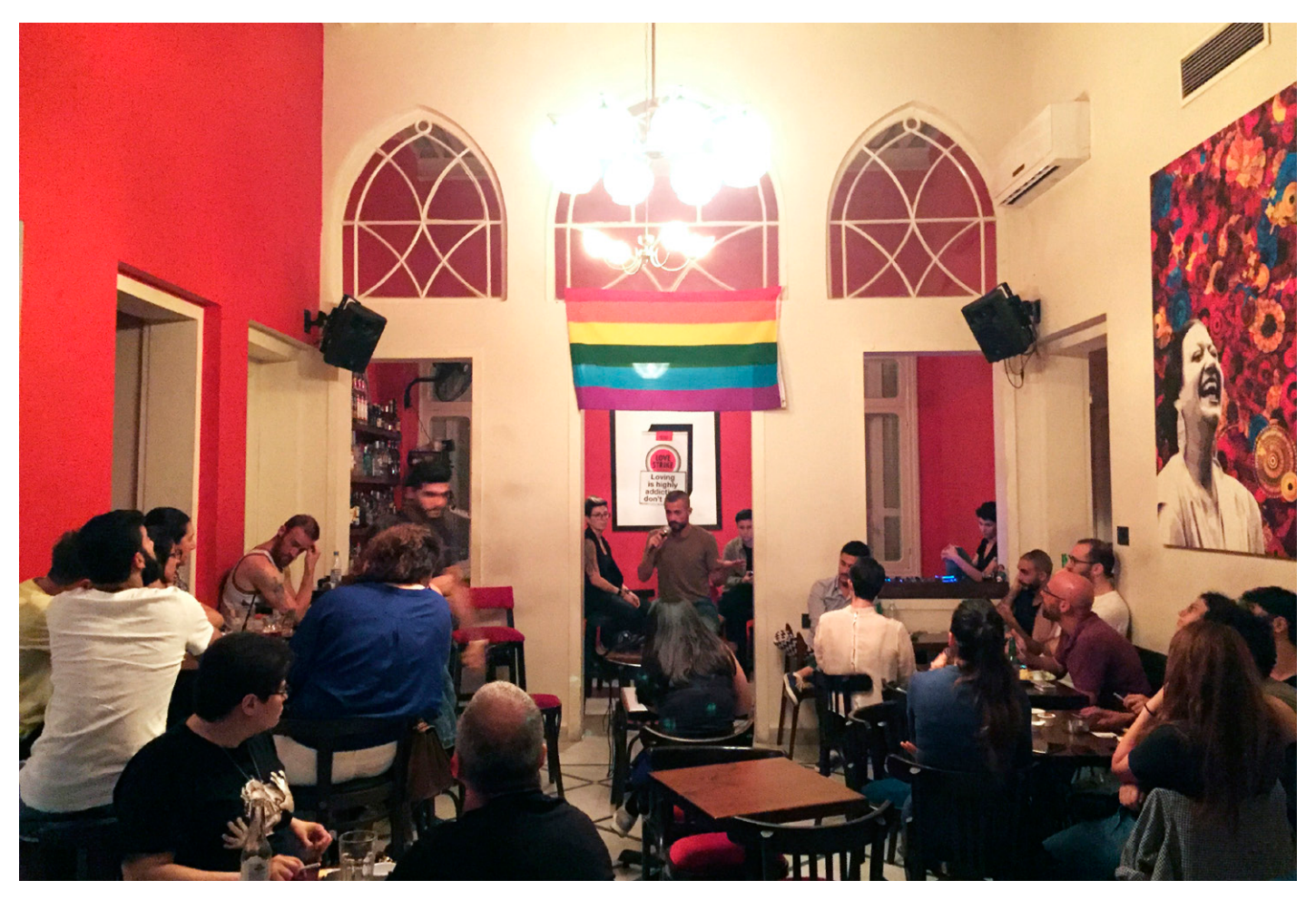
In Beirut, an audience listens to testimonies about encounters with the police over homosexuality. The event was part of Beirut Pride week in 2017 - the city's first.

expression and community building, both of which were destroyed in the 2020 Beirut explosion.53