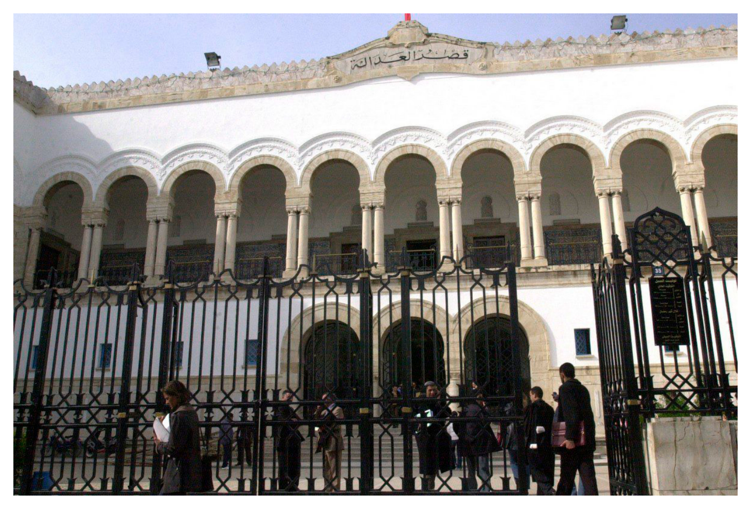
The Palais de Justice in Tunis, Tunisia. LGBTQ+ advocates have won legal protection through the courts.