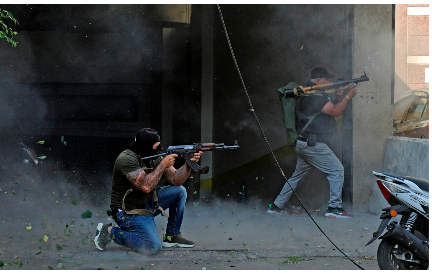
Investigation of Beirut port explosion triggers armed clashes in Tayyouneh between Shiites (Hezbollah and Amal supporters) and Christians (Lebanese Forces supporters) along a former civil war frontline on October 14, 2021.