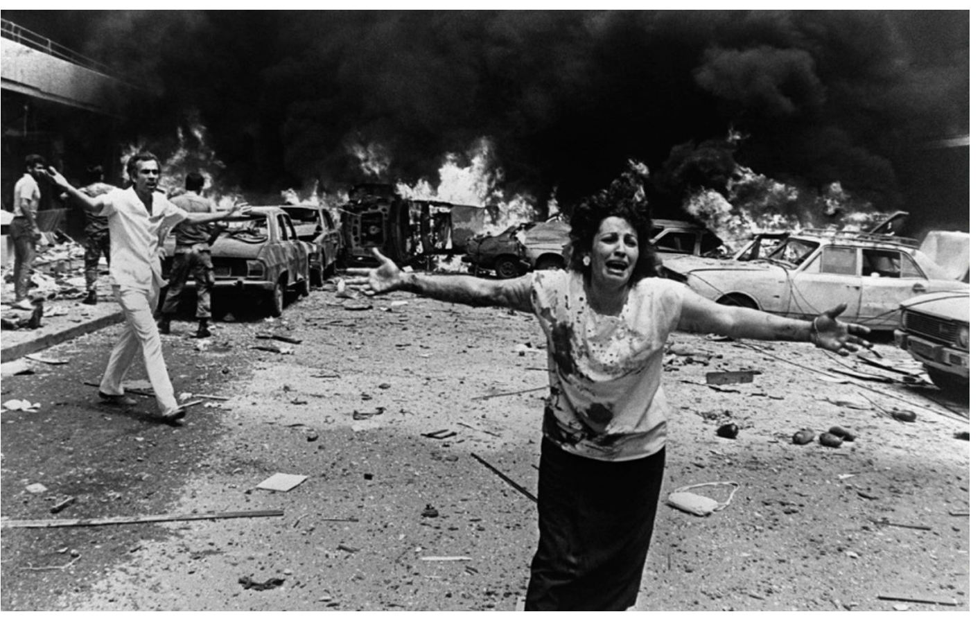
A photo from the April 1975 bus massacre in Lebanon, an incident marking the start of the 15-year Lebanese Civil War.