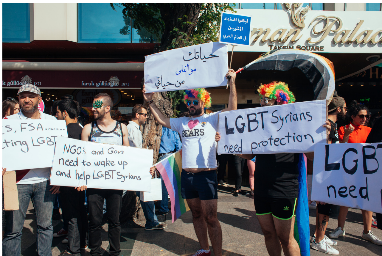
Marchers carry a pro-refugee sign in Istanbul during a banned Pride event. Signs in Arabic read “Stop the persecution of gays in the Arab world” and “Your life is not worth more than mine”.