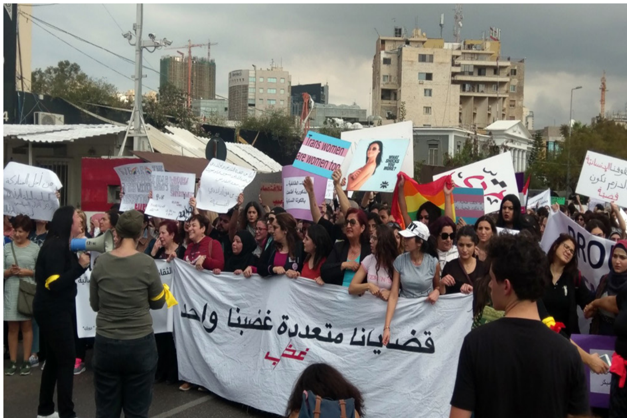
Marchers in Lebanon on International Women's Day 2018.

prejudice or further exploitation. 38 LGBTQ+ refugees in Lebanon report that employers, abusers, and others exploit their fear of local authorities to coerce them into hostile, unsafe, and abusive professional and personal relationships. 39 While the reasons for anti-Syrian attitudes in Lebanon are complex, it is impossible to overlook the sheer scale of Syrians' exodus to Lebanon, which has overwhelmed a relatively small national population, aggravated historical sensitivities, and strained the already fragile Lebanese state. Anti-Syrian prejudice has grown over time, fueled by the manifest failings of the Lebanese political system, violent fallout from the Syria conflict, and the legacy of Syria's 30-year occupation of Lebanon. 40 To make matters worse, since October 2019, Lebanon has been gripped by significant social and economic upheaval (see: Two Countries, One Crisis: The Impact of Lebanon's Upheaval on Syria ), increasing social tensions and economic competition between