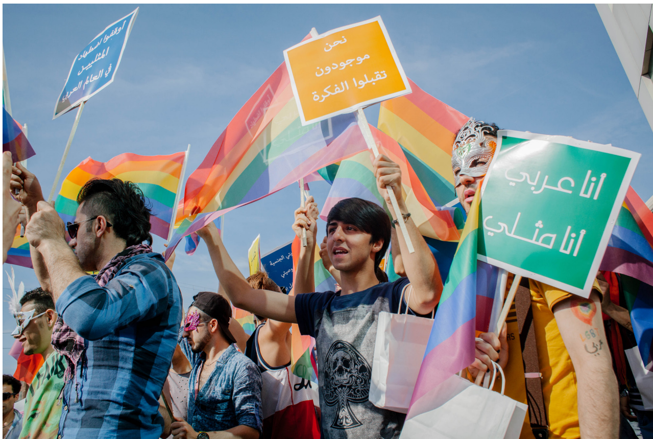
Members of the Tea and Talk group carry placards in Istanbul during the banned Pride events in 2015. The signs in Arabic read “I’m Arab, I’m gay” and “We’re here, get used to it.”

gatherings in Istanbul, while “social sensitivities” and similar justifications have been referenced in bans on public events focused on LGBTQ+ issues in Ankara and elsewhere. 32 Many view this reversal as a result of the changing socio-political climate in Turkey, which coincided with the breakdown of its bid for EU membership — though additional factors are also relevant. 33 Host-refugee relations for Syrians in Turkey have worsened as fiscal instability and the deterioration of the Turkish economy have brought Syrians into pitched economic competition with Turks. Media and popular incitement against Syrians in the country have followed. Paradox-