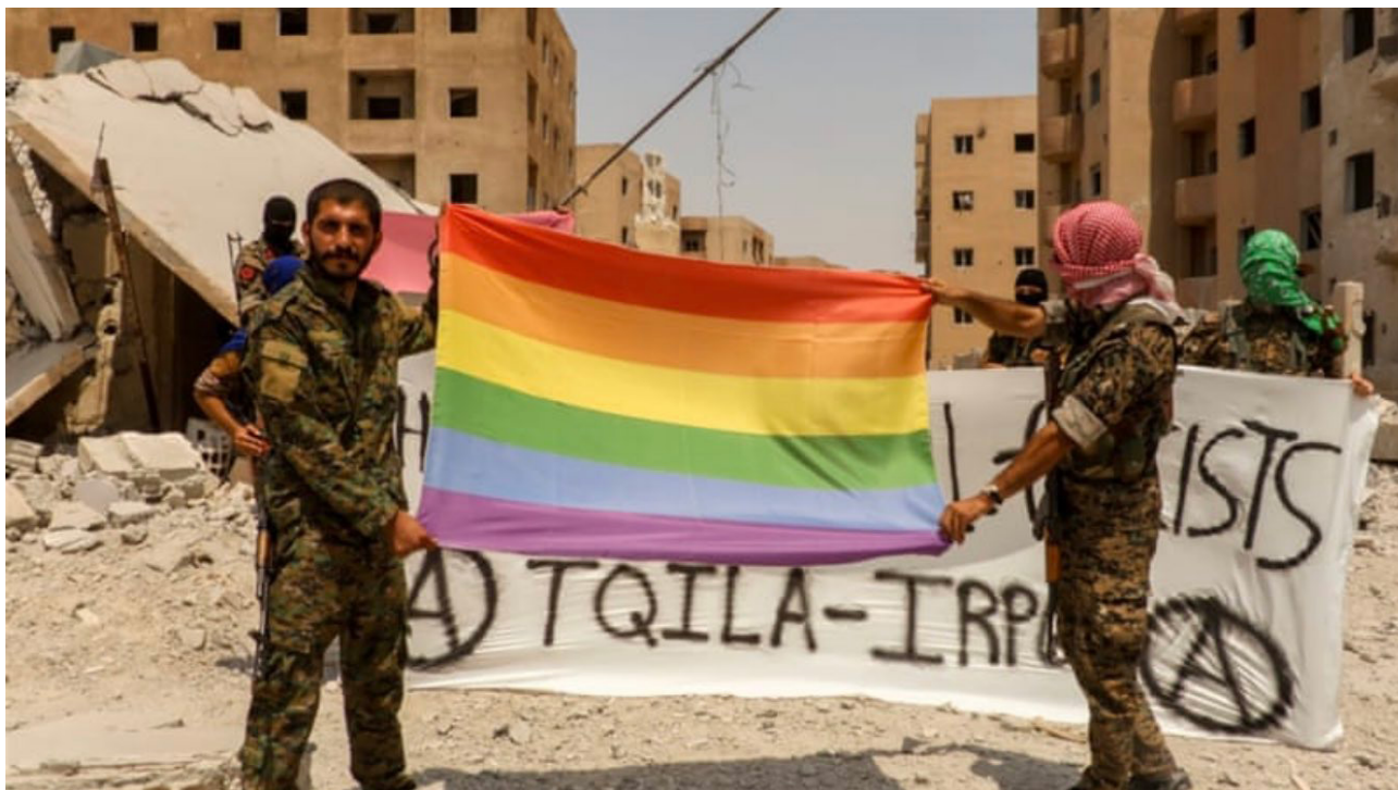
A promotional image posted to Twitter by individuals claiming to have formed an LGBTQ+ armed group to fight IS.