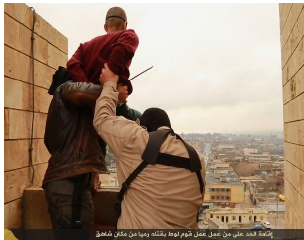
A still image from a propaganda video showing the execution of a suspected homosexual man by IS.

environments for LGBTQ+ Syrians, particularly areas held by violent extremists. 17 Although sweeping claims should be approached cautiously, foreign-born armed group fighters were generally more zealous and punitive in LGBTQ+ matters than Syrian combatants in the same groups. 18 That being said, the frequent changes in controlling actor and armed group mergers and fragmentation have made it difficult to identify actors responsible for violations against LGBTQ+ individuals, thus hampering accountability efforts. In spite of the risks that often manifest as open hostility toward LGBTQ+ persons, opposition areas have continued to attract LGBTQ+ males in particular, given that these areas are seen as a safe refuge from Syrian Government security services, arrest, or military service. In addition, they offer a pathway to asylum in Turkey or Europe (on an open basis before January 2016 and via smuggling routes following the tightening of restrictions thereafter).